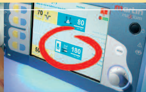
Fig. 3: A typical setting selected on the maxium® HF generator for the sealing procedure illustrated on the left (Fig. 1).

than in conventional forceps coagulation. This requires a generator capable of providing high power intensities to ensure that enough energy (as required for vessel sealing) is supplied to the tissue. Conventional bipolar generators cannot provide such high-power currents. A comparison between the technical parameters of a typical coagulation current and the SealSafe current will show you the difference (see above diagram).